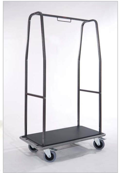
VENEZIA BAG REF 90036