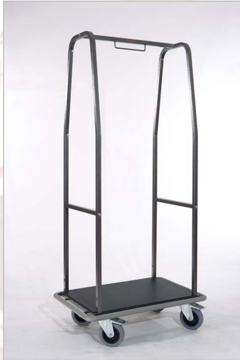
AMALFI BAG REF 90035